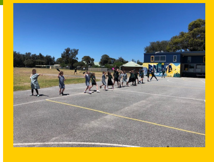
Miss Boyd teaching the students the Nut-bush dance.