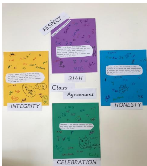
3/4H Class Agreement

3/4H have been developing a Class Agreement based on the student's understanding of the RICH school values. Each child has signed their name showing their commitment to these values and the statements they created together as a class in 2018.