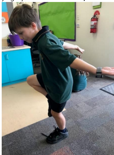
The Seagull – 'I am powerful'.