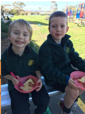
4 Bu Tha