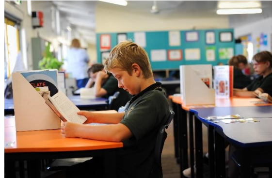
'Taking a Leap into learning'